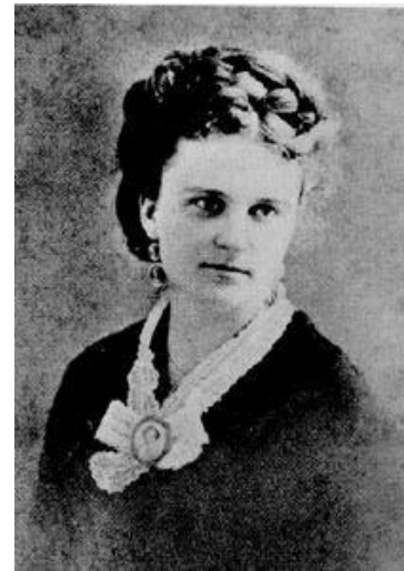
Kate Chopin (short story, feminist ideals)