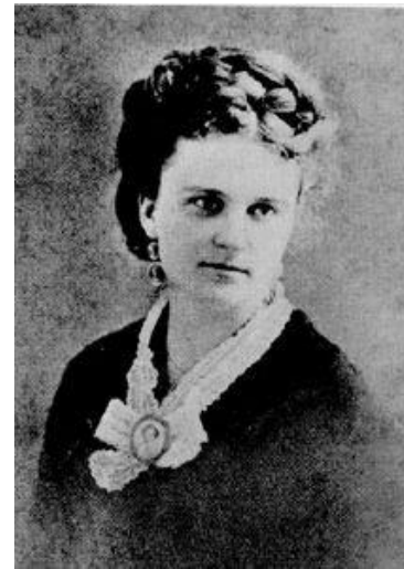
Kate Chopin (short story, feminist ideals)